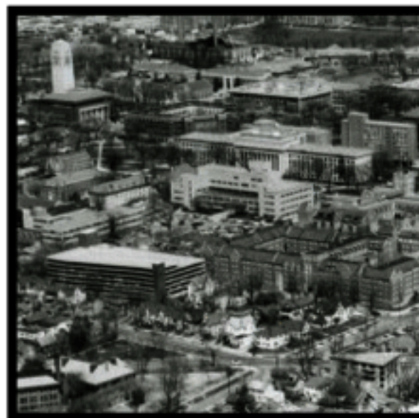
Aerial Map of campus: Moving through CRISP