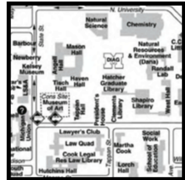
Street map of Central Campus: Orienting new students

visitors can scroll through maps, which enlarge to show audio content (seen next graphic). audio can be grouped according to the topic of the map (ie. stories about changes in information flow layered over the '73 flow chart).